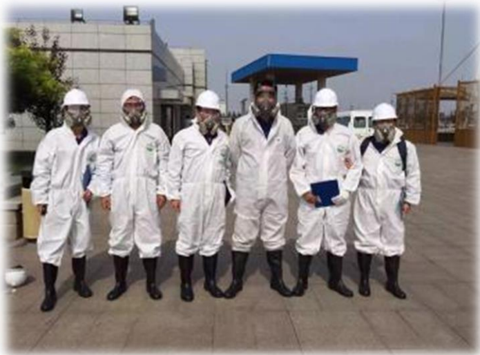
Seal Off Area